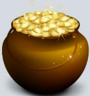
SPLIT THE POT

MOTZEI SHABBOS · DECEMBER 17TH 2011 · 8:00PM VERETZKY HALL · CORNER AVE L & CONEY ISLAND AVE